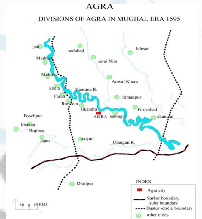
Map 3: Divisions of Agra in 1595

Agra emerged as a very significant town during the Mughal Era , there were countless factors behind its magnitude but the two most important factors which played the strategic role were firstly , that it was the capital city and secondly, the economic worth which it had gained through the trading activity which existed in that period . Agra was also blessed with such geographical features which enhanced its potentialities in being a thriving trading town, the proximity to the river Yamuna was one among them, Agra had become an entrepot .The seventeenth century sources characterize Agra as the most important exchange centre in the Northern India. It acted as the junction for routes from all the directions; it had developed in to a Sub- continental genre for regional and long distance trade and communication and also an important place for manufacture.