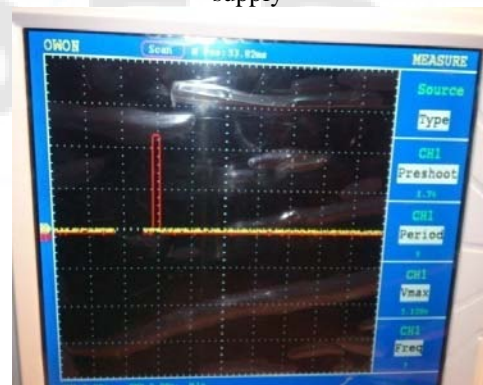
Figure 2: The minimum PWM when using Renewable supply