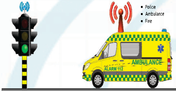
Figure 2: Priority Based signaling

Whenever an emergency vehicle like Fire Brigade Vehicle, Ambulance or Police on pursuit, the transmitter will transmit the RF signals to RF receiver fitted with the traffic poles, they will automatically turn green and rest of the signal stay RED. After passing of that vehicle, all the functionality of the traffic signal will be normal as per specified [9] [14].