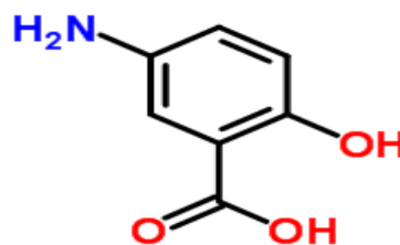
Figure 1: Chemical Structure of Mesalamine

Thanks to Department of Chemistry, S.V University for providing laboratory facilities.