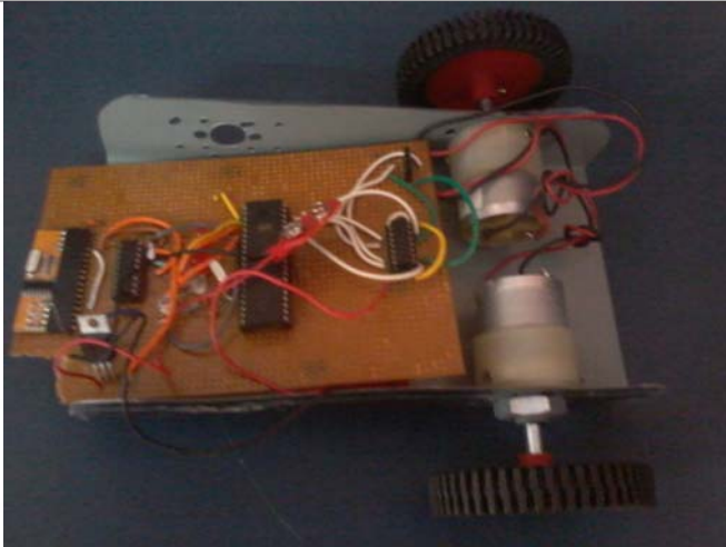
Figure 3: Receiver Circuit