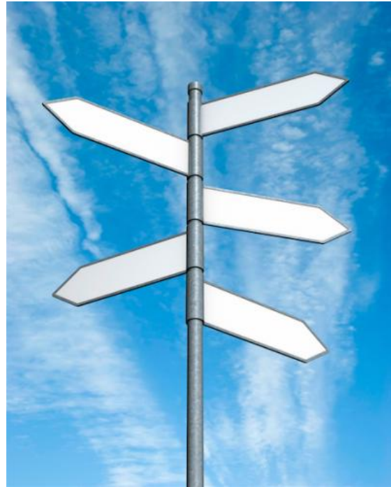
Figure 3: future of cloud computing

There is a wealth of chatter and hype around the cloud right now, especially as more startups continue to go public. Separating the hype and fleeting trends from the reality is often difficult. That said, here are my top five cloud predictions for the coming years: