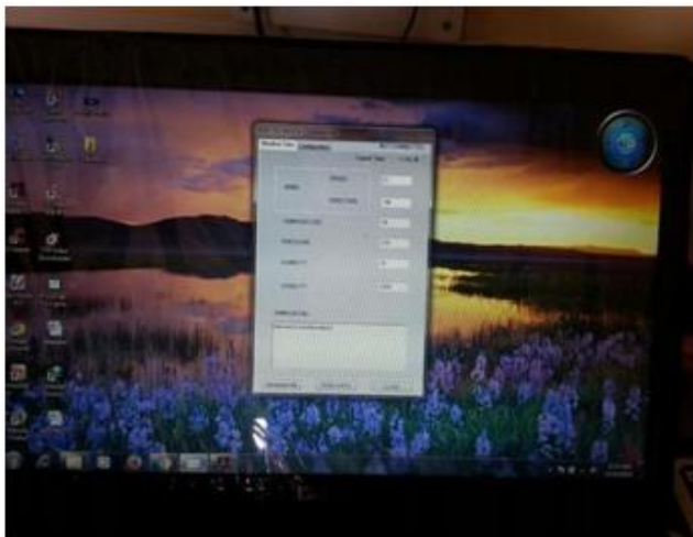
Figure 2: Text to speech software Application