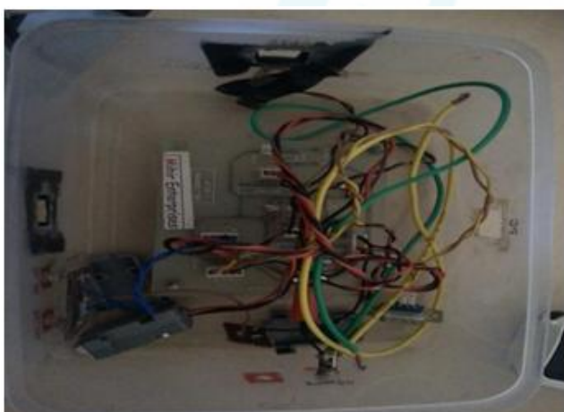
Figure 3: Transmitter circuit kit

Here In this project, we entered the text, (Fig.2) where this Text is converted to speech. So this signals are transmitted through the transmitter circuit Fig.3.receiver. At the receiver end there is one receiver circuit so this transmitted signals are received by receiver circuit (Fig.4) and text is converted to speech and displayed on LCD Screen as shown in (Fig.1) as shown below.