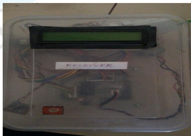
Figure 1: LCD Display of receiver