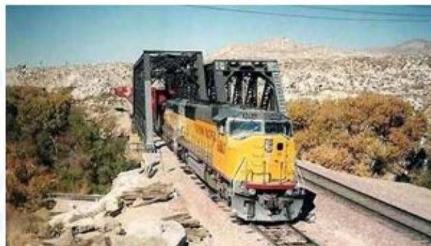
Figure 5: Automatic Railway Announcement System

The status of the train is conveyed to the station master by the nearest observatory. The data is entered by the data entry operator/ Station Master by entering Train number, Arrival/ departure time and status of the train in the screen format. This particular information is converted into synthesized voice ( Text to Voice conversion ) with the help of simple VB application program.