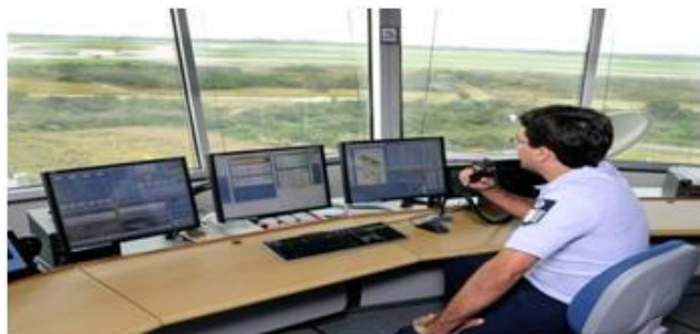
Figure 2.1: ATIS control

this research effort was to have airline pilots formally comment on human factors issues pertinent to the flight deck display of ATIS information. Preliminary design data can then be provided to workstation system designers for their use in the initial maintenance update by Aeronautical Radio, Inc. (ARINC). Phase II will be the field studies at Airport. Phase III will consist of evaluation in the Federal Aviation Administration (FAA) Technical Center's Reconfigurable Cockpit Simulator (RCS) mockup, and high fidelity simulators, in an operational evaluation-typesetting.