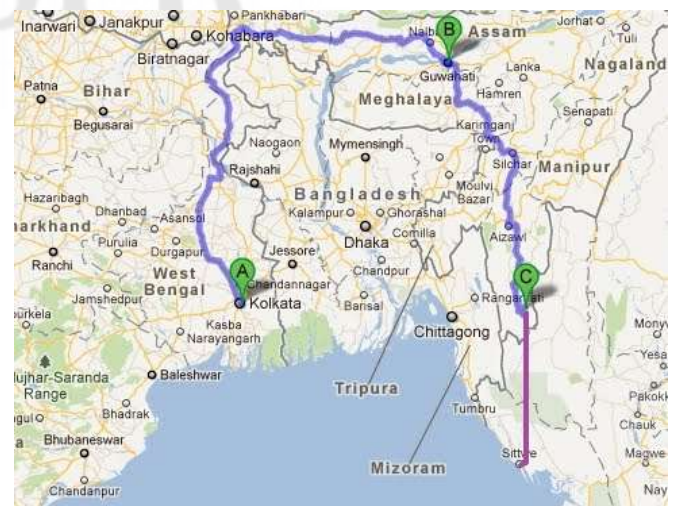
This project will reduce distance from Kolkata to Sittwe by approximately 1328 km