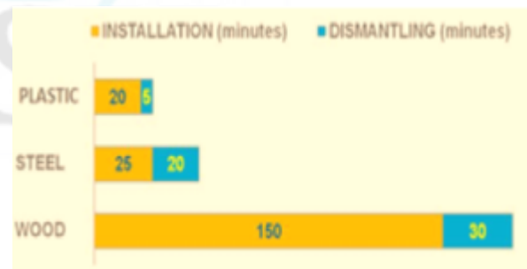
Feature comparison chart

Duration with Plastic formwork= (14750 \times 3 / 100) / 365 = 1.21 \text{ yrs.}