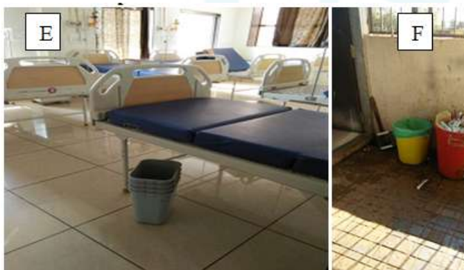
E: Common bean used in Bhalke Vydehi, F: Improper dumping of waste in Bhalke Vydehi, G: Improper disposal of general waste in bhalke Vydehi