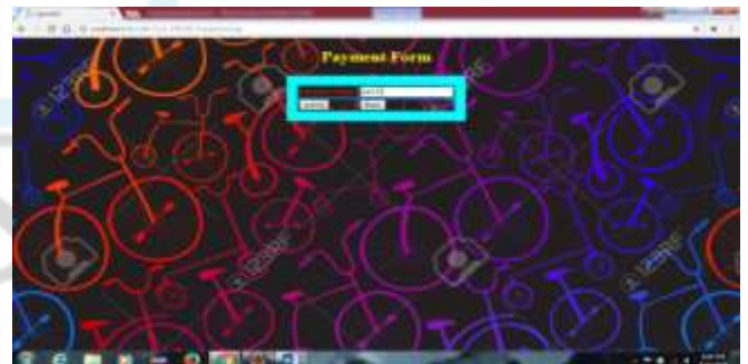
Figure 1.1: Payment Process