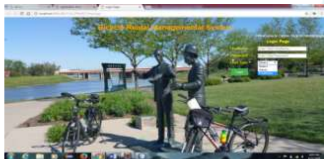
Figure 1.1: Employee login