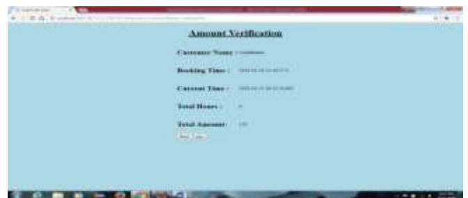
Figure 1.1: Payment Verification