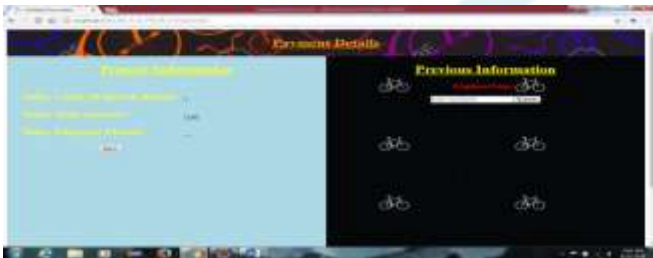
Figure 1.1: Daily Activities