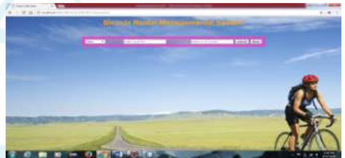
Figure 1.1: Adding Bicycles