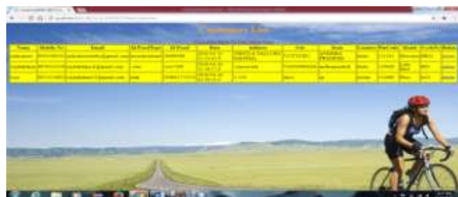
Figure 1.1: Customer List