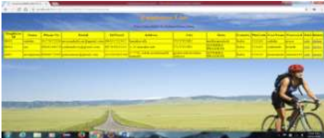
Figure 1.1: Employee List