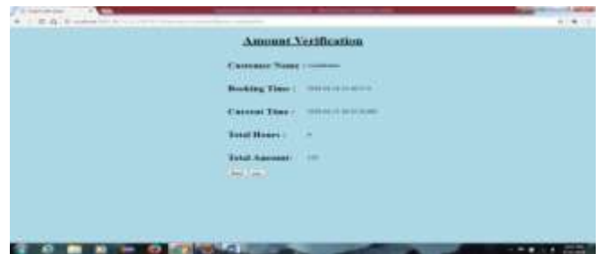
Figure 1.1: Payment Verification