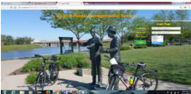
Figure 1.1: Employee login