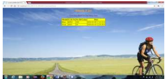
Figure 1.1: Bicycle List

Few screenshots related to the Bicycle Rental management System and how to interact and using with employee and admin as follows.