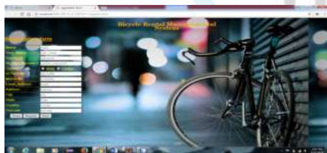
Figure 1.1: Employee Registration