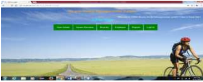
Figure 1.1: Admin Page