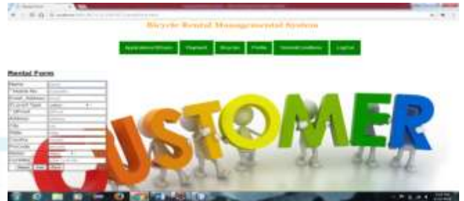
Figure 1.1: Customer Rental Form