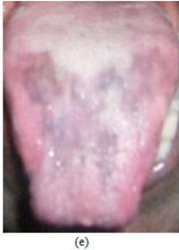
Figure 2: Tongue sub-lingual veins segmentation steps: (a) ROI, (b) enhanced ROI, (c) coarse level representation, (d) fine level representation, and (e) segmented veins.