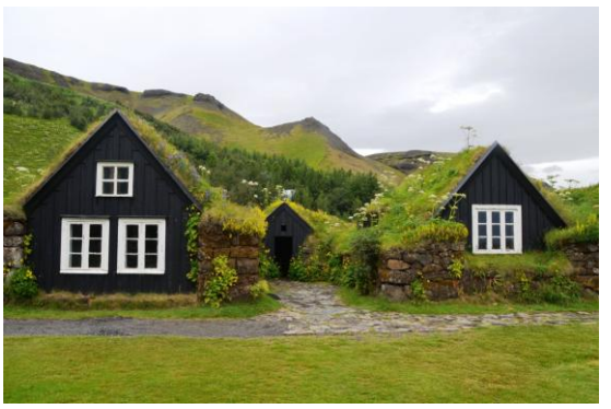
Figure 2: An example of a turf roof

continued to be in practice. Sod roof or turf roof which is predominantly practiced in the Arctic region is one of the good examples of a locally adopted building practice (Figure 2). Available building materials could not provide sufficient insulation against the extremes of weather in the Arctic region. Sod roofs provide thermal insulation and benefits from the thermal mass effect [7]. The basic notion of green roof structures over centuries of practice has persisted in modern times; yet, the techniques and materials have been restructured since the 1960s.