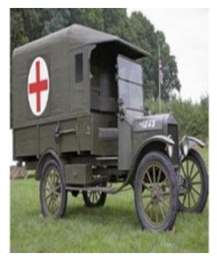
Figure 1: First 1487 Spanish Ambulance

Historically, ambulance begins in ancient times, with the use of carts to transport incurable patients by force (Hanfling et al., 2012). Ambulances were first used for emergency transport in 1487 by the Spanish, and civilian variants were put into operation during the 1830s (Bohm & Kurland, 2018). Advances in technology throughout the 19th and 20th centuries led to the modern self-powered ambulances (Safeer et al., 2014).