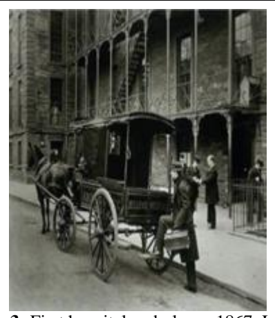
Figure 3: First hospital ambulance 1867, London

ISSN (Online): 2347-3878 Impact Factor (2018): 5.426