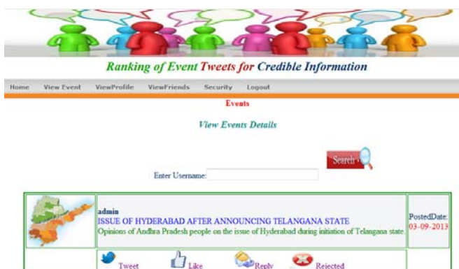
Figure 4: Interface to View Event for User

The above Figure 2 and 3 show pages which are responsible for both posting and viewing events. Activities like posting and deleting events will be allowed by administrator only. In this paper, an event by name “Issue of Hyderabad after announcing Telangana State is posted by administrator”. The Event posted by administrator will be seen by the users who are registered. Posted Event gives clear description about the event and also image related to that context. The description given for this event is – “Opinions of Andhra Pradesh people on the issue of Hyderabad during initiation of Telangana state”. The image used in this context is a map of Andhra Pradesh state that shows bifurcation of Telangana state.