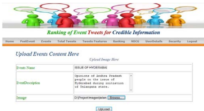
Figure 2: Interface to Post Tweet for Admin