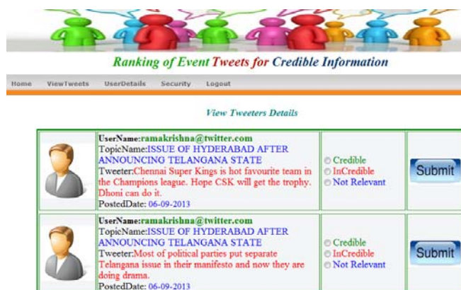
Figure 6: Interface to Annotate Tweets for Annotators

The following Figure 6 shows interface by which the human annotators annotate the tweets by selecting one of the three options. Human Annotators who are well known of event will eliminate the tweets which are not related to the event posted by admin. In this paper, three annotators perform annotations process to give annotated tweets to the admin. After the process of Annotation, Annotators provide the tweets which are related to the event and thus annotated tweets collected by admin to perform further processing. In this paper, human annotators annotated 102 tweets of an event and provided 57 annotated tweets of an event for ranking according to the credibility of information contained in it. In this project, Human Annotation process eliminated 44% of tweets which are not related to event.