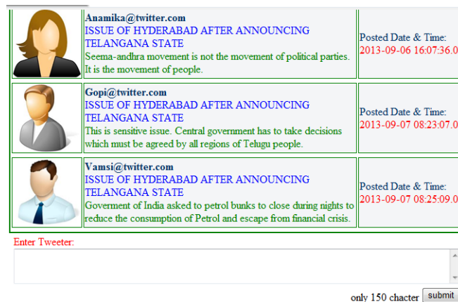
Figure 5: Interface to Post Tweet for User

The above figures 4 & 5 display the interface to view and post tweets on the event posted by admin. User can view tweets of different users of the same event. The above figure 5 shows the tweet of a user followed by posted date along with time. User can post any number of tweets on single event posted by administrator.