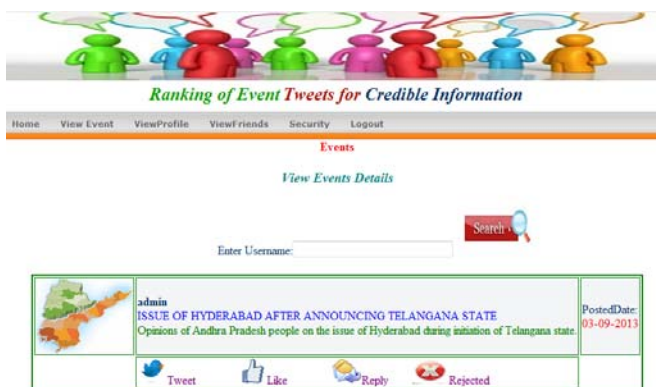
Figure 3: Interface to View Event for Admin

The above Figure 2 and 3 show pages which are responsible for both posting and viewing events. Activities like posting and deleting events will be allowed by administrator only. In this paper, an event by name “Issue of Hyderabad after announcing Telangana State is posted by administrator”. The Event posted by administrator will be seen by the users who are registered. Posted Event gives clear description about the event and also image related to that context. The description given for this event is – “Opinions of Andhra Pradesh people on the issue of Hyderabad during initiation of Telangana state”. The image used in this context is a map of Andhra Pradesh state that shows bifurcation of Telangana state.