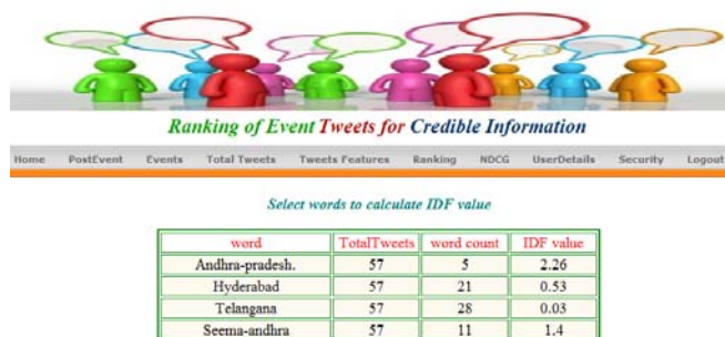
Figure 8: Ranked Tweets