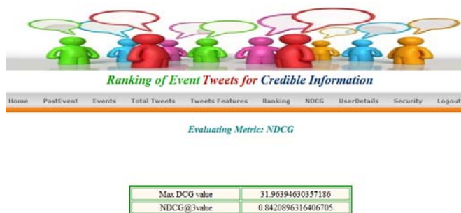
Figure 12: Displaying NDCG@3 value

In the above Figure 12, maximum DCG@3 value and NDCG@3 value is shown. NDCG@3 value is 0.84208 which represents that ranking used was 84.2% efficient.