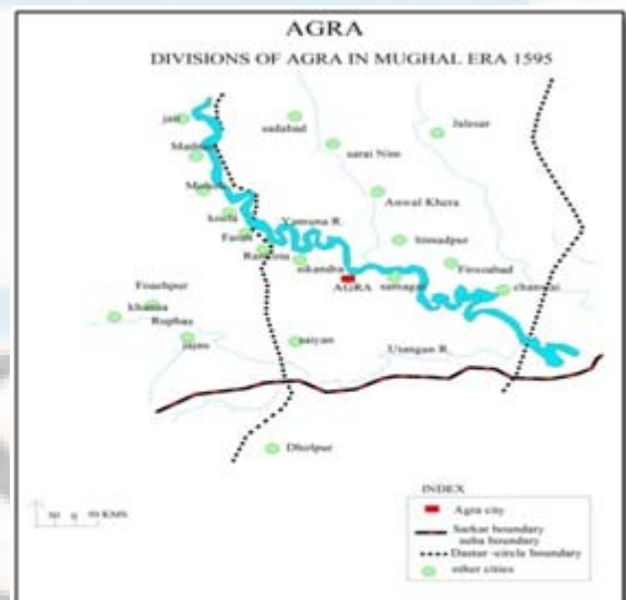
Figure 1: Divisions of Agra in Mughal Era 1595

All goods moving between any two diverse parts of the empire were required to make a halt here. Apparently the city besides handling its own imports and exports was also acting as a transit depot, thus adding to its own Thus during 16 and 17 centuries Agra became a nucleus of international trade and reached its pinnacle in economic prosper. Besides its favourable geographical setting, undeniable other factors also played a conspicuous role in the economic advancement of Agra. The commercial and industrial life of Agra could not have received such a momentum had there not been a constant supply of food stuff and raw materials from the fertile hinterland for the overgrowing needs of the city's mobile and permanent population. They were complimentary to each other, resulting in a relationship of mutual benefit. The surrounding hinterland found a ready market for their agricultural produce and the population of Agra city never felt a paucity of such articles of daily consumption.