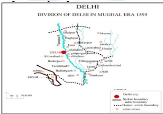
Figure 2: Division of Delhi in Mughal Era 1595

It appears that a large variety of goods were exported annually from Cambay and the vessels on their onset composed and brought various special goods and commodities from different places