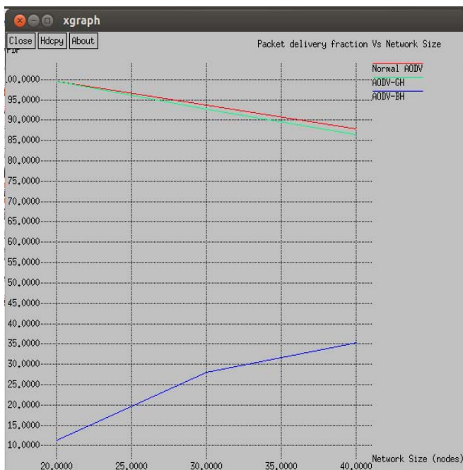
Figure 7.2: Impact of attacks on PDR

Packet delivery fraction in case of attacks and without attack depends on the protocol routing procedure and number of nodes involved. PDR is calculated by considering number of nodes 20, 30 and 40 for different routing protocols are plotted in graph as shown in figure 7.2.