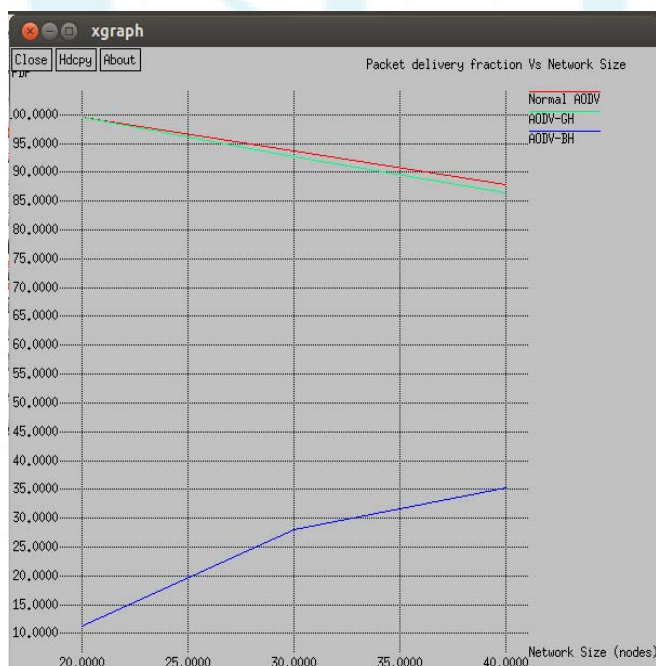
Figure 7.2: Impact of attacks on PDR

Packet delivery fraction in case of attacks and without attack depends on the protocol routing procedure and number of nodes involved. PDR is calculated by considering number of nodes 20, 30 and 40 for different routing protocols are plotted in graph as shown in figure 7.2.