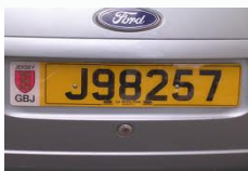
Figure 2 (a): Original Image

Following images show the segmented characters from the RC plate: