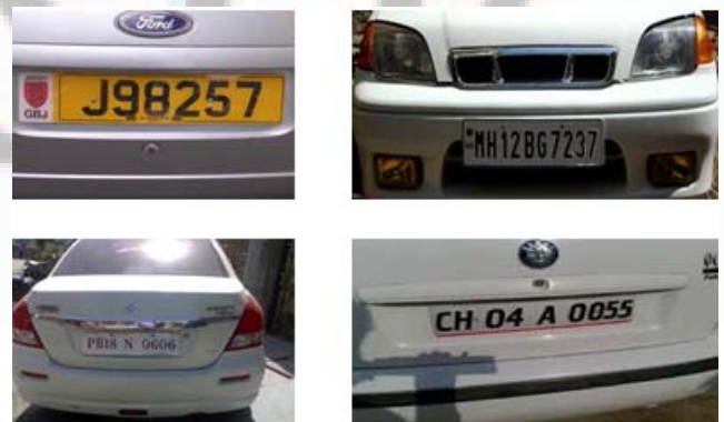
Figure 1: Acquired images

Vehicle's RC plate is grabbed using the CCD camera. The acquired image is in jpeg format and is converted to gray scale image using the rgb2gray command in MATLAB. Following images show the acquired images.