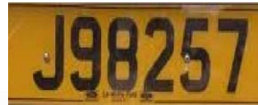
Figure 2(b): RC Plate Extraction