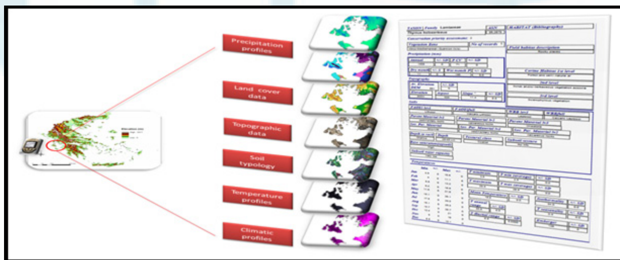
Figure 1.3: Spatial Analysis and GIS Modeling