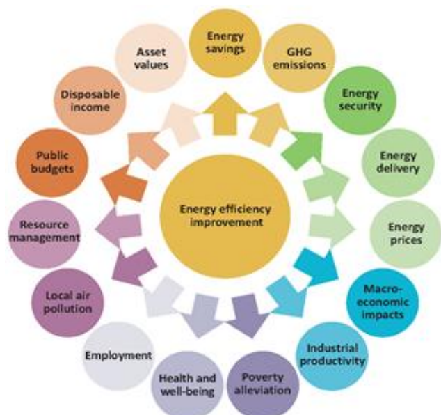
Figure 1: Summary of the Benefits of Energy Efficiency