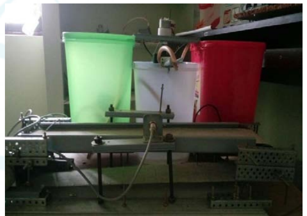
Figure 4.2: Photographs of proposed work