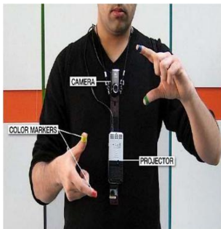
Figure 1: Gesture based design[1],[2]

Sixth sense technology is mainly based on hand gestures recognition, image capturing, processing and manipulation etc.