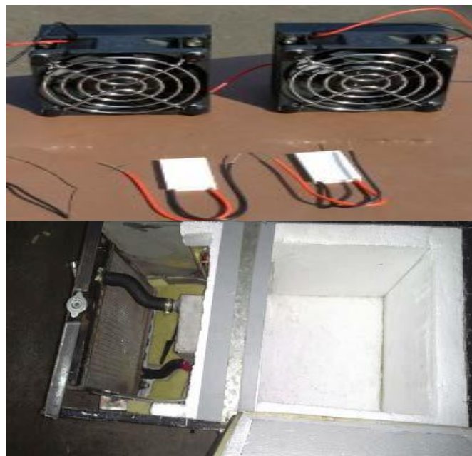
Figure 2: Schematic Diagram of developed thermoelectric refrigeration cabinet

We designed and developed an experimental thermoelectric refrigerator (Figure 2) with refrigeration space of 5Liter capacity. Eight numbers of Super cool make thermoelectric cooling modules (Imax=4.7A, Vmax= 12V) (Figure 2) were selected on the basis of active heat and passive heat removal from thermoelectric refrigeration cabinet.