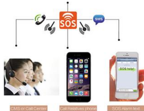
Figure 2: Fall detector system

The uses of IoT in elder care ranges from tracking wandering patients to monitoring the engagement and activities of elderly individuals in nursing homes and hospitals. Some of the popular applications are time driven reminders of daily activities [4]. The device sends reminder messages to wireless-enabled appliances. It takes necessary action in the lack of response. A reminder can be sent more times, after which a designated on-site personnel or a healthcare provider is notified. IoT is used by fall detector.