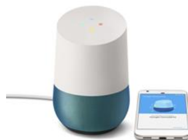
Figure 4: Google home speaker

Google Home is a voice-activated speaker powered by the Google Assistant [11]. The user can ask it questions or tell it to perform tasks. Just start the command with, "Ok Google" to alert the speaker that the user is giving the device a command. Google Home [12] includes home automation as a feature, enabling owners to use it to control devices as a central hub. Google has partnered with many product based companies like Nest, SmartThings, Philips Hue, and IFTTT for smart home device control with the Google Home device. Google Home can also be controlled by using its mobile application.