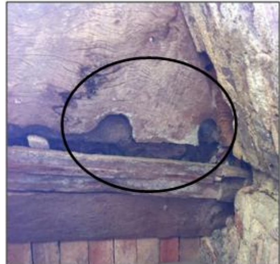
Figure 4: Timber decay at Saint Rose of Lima Parish Church

Moreover, there were human errors observed at St. Rose of Lima Parish Church, Our Lady of Atocha Parish Church and at San Pablo de Cabigan Church. An example is the improper installation of electrical wirings which was observed at St. Matthias Parish Church. However, it was observed that only at St. Rose of Lima Parish Church, where decay of timber structures was present.