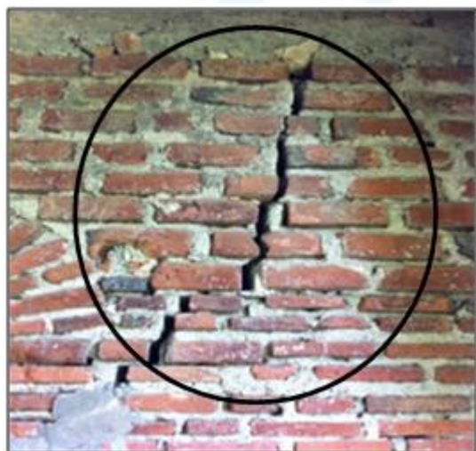
Figure 3 (b): Cracks on the walls of San Pablo de Cabigan Parish Church