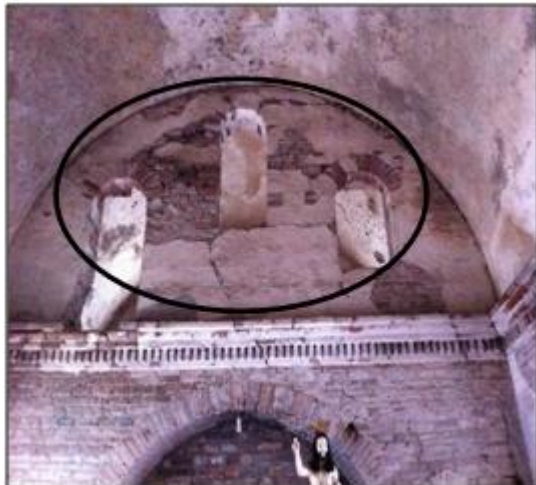
Figure 3 (a): cracks on the walls of the St. Matthias

Moreover, there were human errors observed at St. Rose of Lima Parish Church, Our Lady of Atocha Parish Church and at San Pablo de Cabigan Church. An example is the improper installation of electrical wirings which was observed at St. Matthias Parish Church. However, it was observed that only at St. Rose of Lima Parish Church, where decay of timber structures was present.