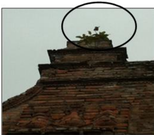
Figure 7: Botanical growth at our Lady of Atocha Parish Church