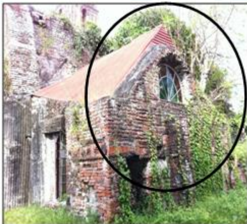
Figure 8: Abundant botanical growth at San Pablo de Cabigan Church