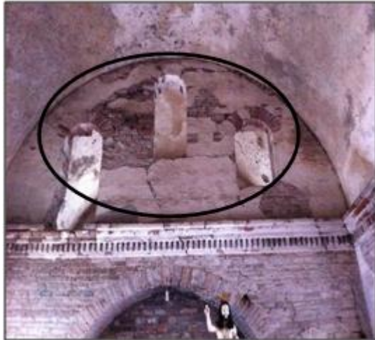
Figure 3 (a): cracks on the walls of the St. Matthias