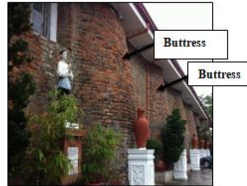
Figure 1: The presence of buttresses at our Lady of Atocha Parish Church

Table 2 shows the main structural members of the churches in terms of beams, columns, and buttresses. As gleaned from Table 2, most of the churches has no beams and no columns while buttresses were used as main structural members in almost all the churches except for Our Lady of Pillar Parish church. These buttresses support the walls and also it strengthen the whole structure of the heritage churches. Beams and columns are the structural members seen only in Our Lady of Pillar Parish church.