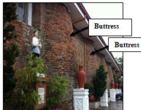
Figure 1: The presence of buttresses at our Lady of Atocha Parish Church

Table 2 shows the main structural members of the churches in terms of beams, columns, and buttresses. As gleaned from Table 2, most of the churches has no beams and no columns while buttresses were used as main structural members in almost all the churches except for Our Lady of Pillar Parish church. These buttresses support the walls and also it strengthen the whole structure of the heritage churches. Beams and columns are the structural members seen only in Our Lady of Pillar Parish church.