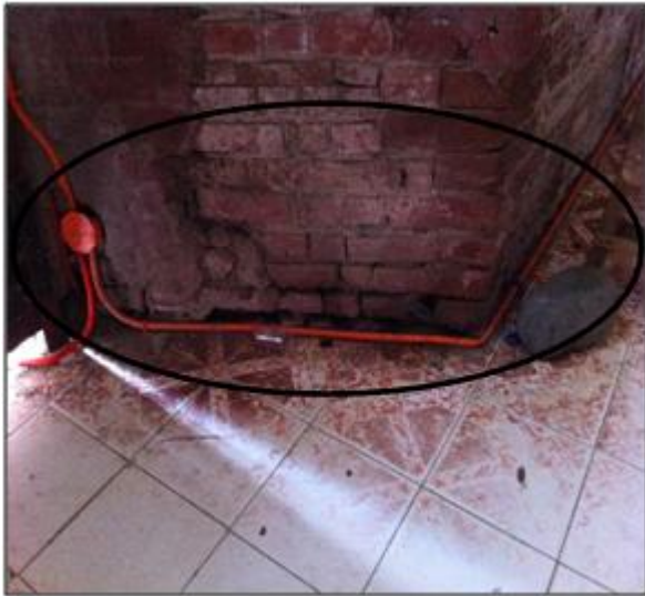
Figure 6: Human error (improper installation of electrical pipe) at St. Matthias Parish Church