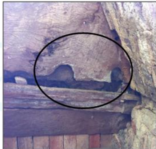
Figure 4: Timber decay at Saint Rose of Lima Parish Church